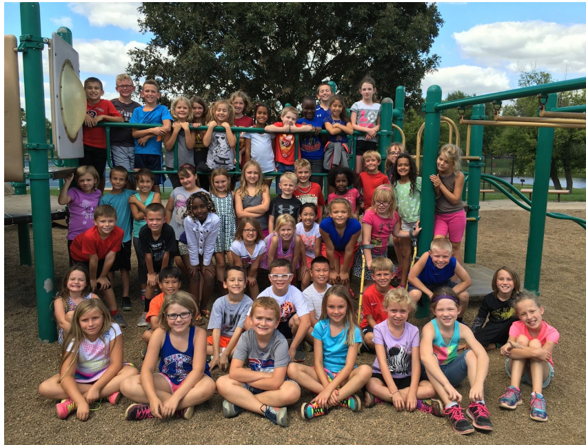
Valerius 3rd Grade 2016-17

The third graders are learning the expectations of the school and working on being responsible, respectful, and safe. We recently started our first reading unit and the children are learning strategies for visualizing and identifying story elements. In math we have been reviewing place value, rounding, adding and subtracting, and telling time. In social studies we are learning about maps, globes, and landforms. Third grade is busy here at Valerius!