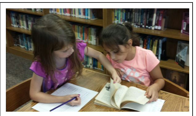
The 2nd-graders spent a day as "medical residents," diagnosing "sick" books and deciding whether they could be fixed or needed to be replaced.