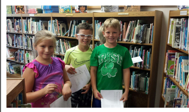
Students enjoyed getting up and moving during a scavenger hunt to locate all the sections we have in the Valerius library.

The kindergarten-2nd-graders are finishing up their work on learning about how to use the library and the rules of book care. Ask your child to tell you some of the ways we keep books in good shape so others can enjoy them! The 3rd-5th-graders are becoming library experts, learning how to independently find the books they want in any library in the world using a computer catalog and their knowledge of how libraries are organized. In addition, the older students have been introduced to our library's Symbaloo, which houses many of the resources we will use during the year. If you'd like to bookmark for home use, you can find it by using the shortened url: <u>goo.gl/Knqe69</u>. I will continue to add resources as the year goes on.