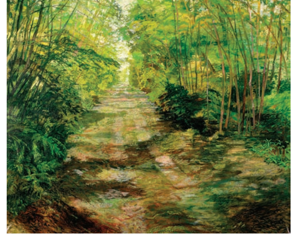
Entrance to Erchless (1900s), Victoria Crowe. Oil on canvas, 96.5 cm × 111.7 cm. The Fleming-Wyfold Art Foundation.

Why," he said, banging on the table till the baked beans leaped about, "if I could find a bit of sunshine near here, permanent bit that is, dja know what I'd do?"