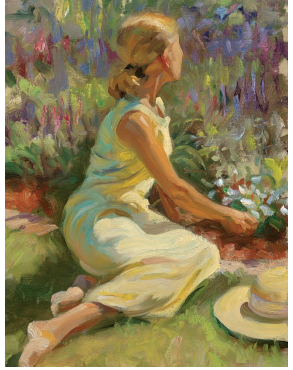
Yellow Dress (2003), Jeffrey T. Larson. Oil on linen, 12" x 16".

over the blueness of the sky. At night they sat on the back doorstep while Mrs. Hatching clucked inside as she dished the supper, "Starstruck ee'll be! Come along in, do-ee, before soup's cold; stars niver run away yet as I do 220 know."